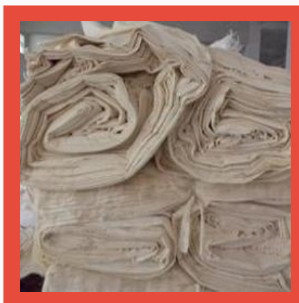
Grey Cotton Drill Fabric