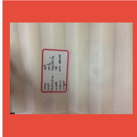
Satin Weave Fabric