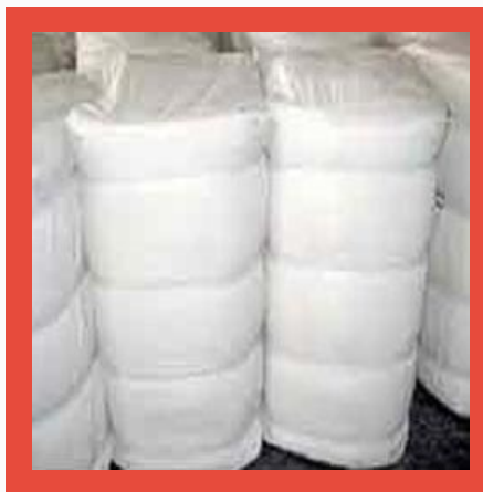
Plain Grey Fabric