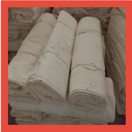
Poly Cotton Fabric