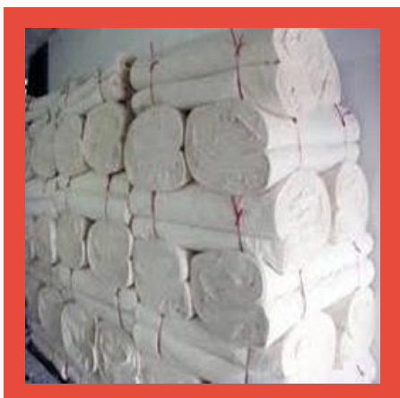
Cotton Grey Fabric