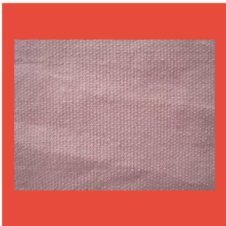
Polyester Cotton Fabric